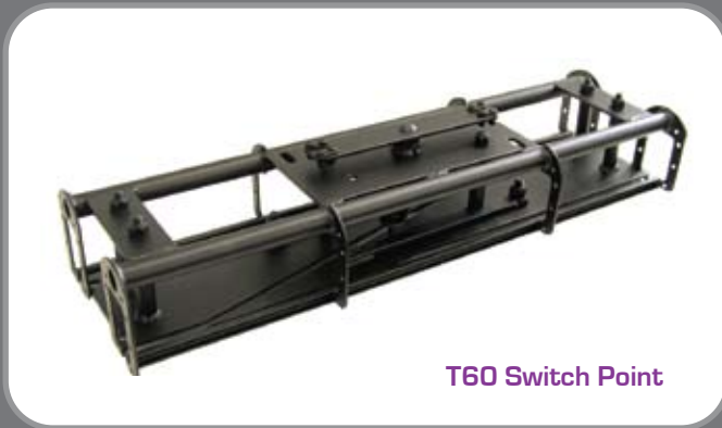
T60 Switch Point

Black epoxy powder coat finish minimizing reflection. Other colours and finishes available on request.